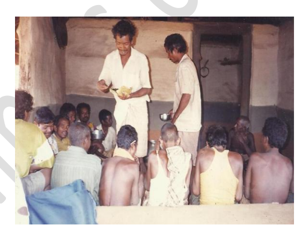
Figure 2 Decease Family Provide Rice for feast