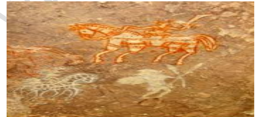
(Fig. 4 Bhimbetka Rider)

Both Pabuji and Gogaji are depicted on the phad as equestrian warriors, and therefore, of interest to this study are the early equestrian figures, in particular, the two-toned figure of the sword- waving equestrian warrior from Bhimbetka in Madhya Pradesh, painted explicitly in outline. This technique emulates styles used in petroglyphs originating from the Palaeolithic and Mesolithic periods even though that particular painting is dated to 'the historic period', the 1st millennium BCE.