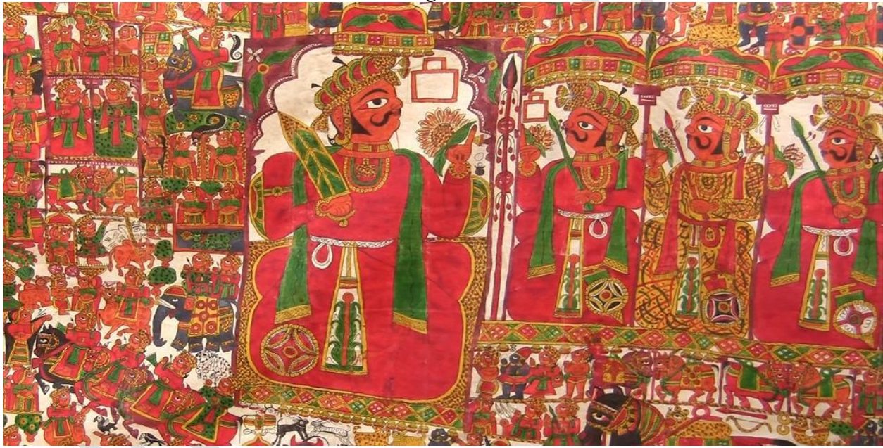
(Fig. 1 Traditional design of Pabuji's 'phad').

The actual origin of the lyrical singing of this vernacular epic is unknown but it was first recorded in 11<sup>th</sup> century. The Phad and Rawanhatta are essential elements in the performance as it embodies the ancestral tradition of bhopa community and portrays the alluring deeds of divine hero. In the Pabuji's epic performance 'Phad' is the red colored painted scroll with a complex schematic pictorial showing of multiple episodes of charismatic actions of Pabuji, described in the epic, along a series of horizontal planes. Although one may find various version of phad having different schematic arrangements of events but in each case the picture of Pabuji is always located at the centre. Bhilwara's Joshi caste is patronize in printing and designing traditional phad. In principle, each phad comprises 100 different schemat schematic rather than chronological order, stretching along four to five meters of cloth, one and a half meters high.