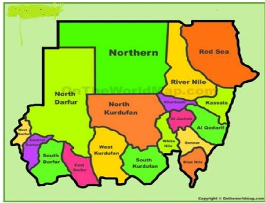
Map1.Shows the different States in Sudan 111.

Graph (1) reflects the occupation of the respondents in different States in Sudan (2012)