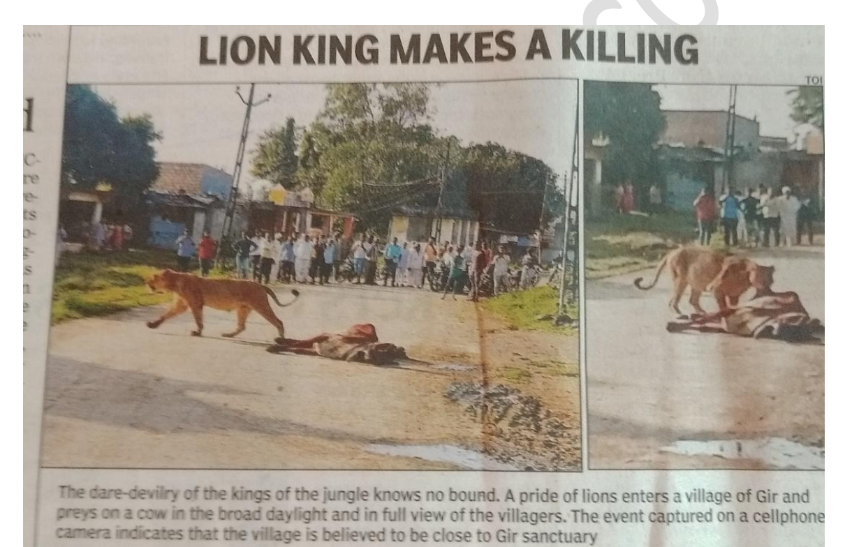
Figure 1: Lion in the village