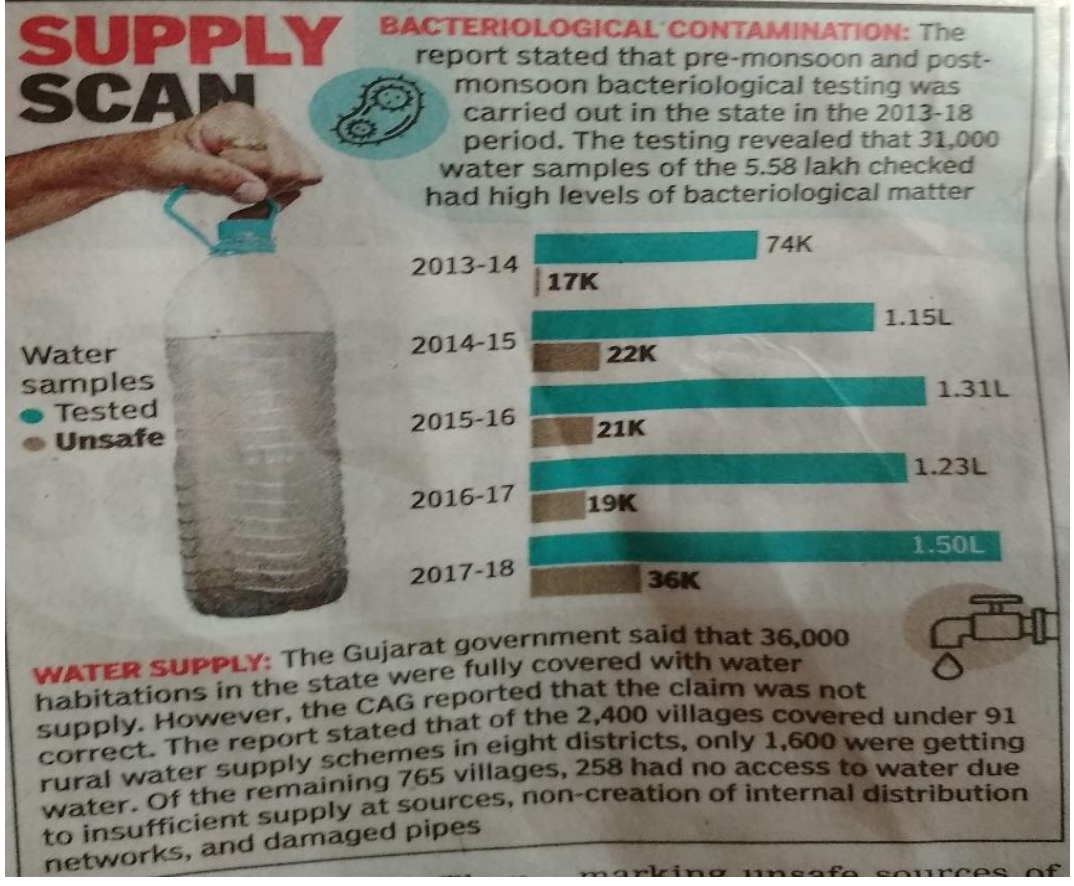
Figure 6: Bacteriological contamination of water