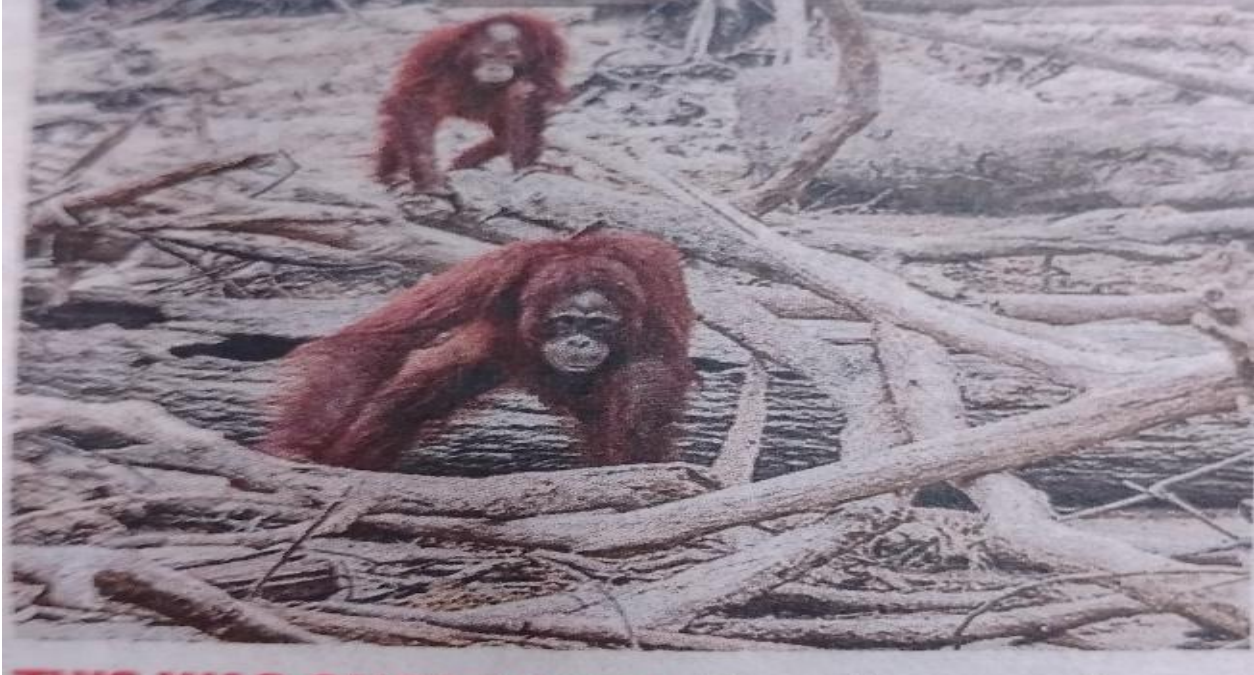
THIS WAS ONCE HOME: The destruction of their rainforests has left orangutans with little natural habitat to survive in

Source: Galdikas, B. (2020, September 26). Saving Orangutans will preserve humanitywomen sustain life and they understand this. Times of India. P.7 Here also teacher can ask some challenging questions to reflect upon: